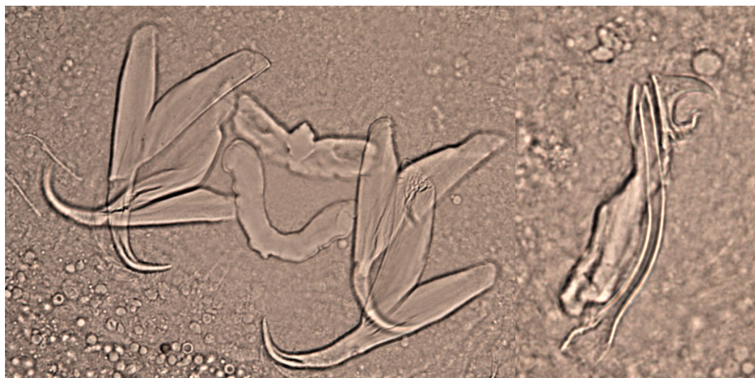
Fig. 2. The attachment apparatus and copulatory organ of Ancyrocephalus cruciatus from Amur sleeper (pond of Jersika) with 600x magnification, Nikon eclipse 90i (original photo).

Diversity of parasite species markedly varies between water bodies where the greatest number of species found in pond of Likсна (the