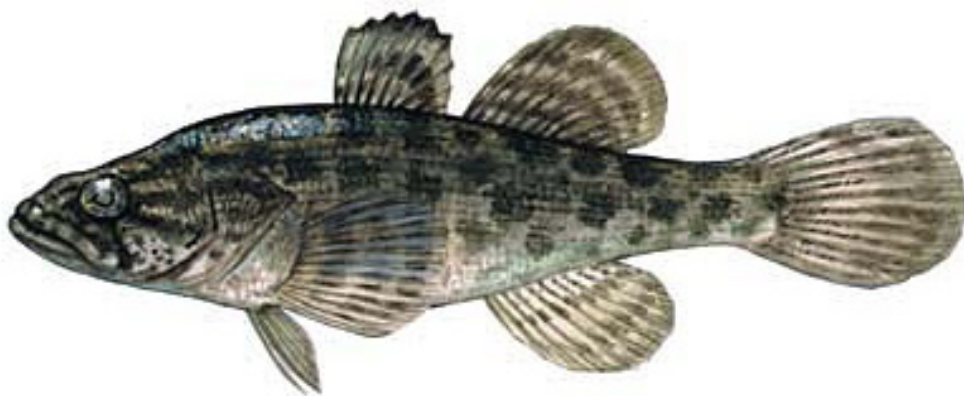
Fig. 1. Amur sleeper Perccottus glenii Dybowski, 1877 (Plikšs & Aleksejevs 1998).

Parasites were detected in fish organs and tissues using stereomicroscope Nikon SMZ 800. All parasites were counted, except protozoans. Parasites were photographed with microscope Nikon eclipse 90i for accurate determination of parasite species. Morphological features were used for parasites identification until genus or species level, by Key of the parasites of freshwater fishes in fauna of the USSR (Gussev