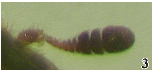
Fig. 1-3. Attagenus (Aethriostoma) philippinensis sp. nov.: 1- habitus, dorsal aspect; 2- head and pronotum; 3- antennae of female.